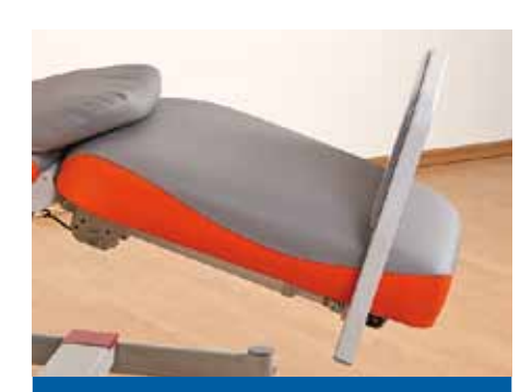
The completely closed leg segment with electrically adjustable footrest offers higher hygiene standards.