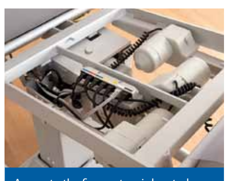
Access to the five motors is located directly underneath the removable upholstery.