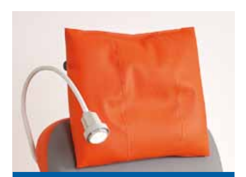
Your patient can adjust the height and position of the head pillow easily with one hand only and find the most comfortable position.