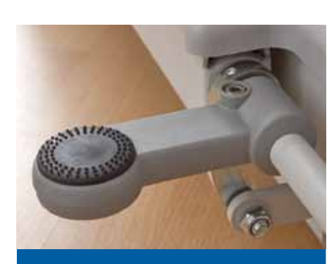
The central brake on both sides allows a fast fixation of all four wheels.