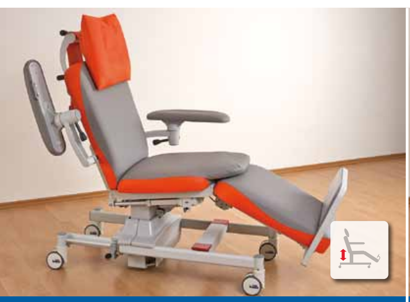
The upright position for entry and exit is activated with one preprogrammed button.