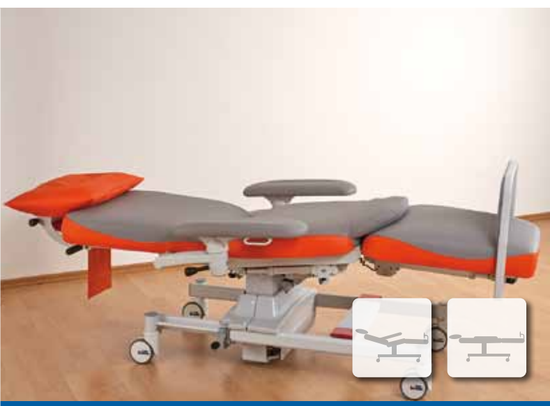
For optimum relaxation the ComfortLine2 offers individual adjustment of all segments.