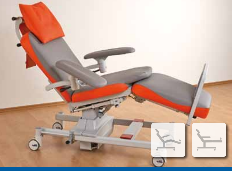
The armrest can be adjusted to the desired position and even turned completely with one lever.

The ComfortLine2 combines the latest standards in hygiene with the experience and well known technical properties. Smooth and compact surfaces make cleaning easy, compliment the design and underline the high quality standards. The excellent appearance and higher comfort are supported by the sophisticated upholstery technology.