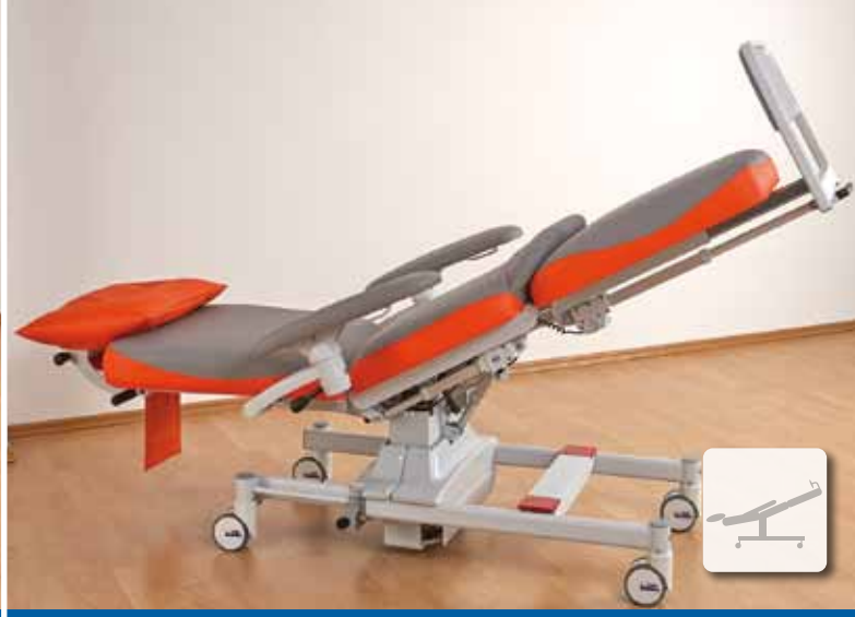
The extra wide foot pedal activates the shock position, allowing the medical team hands-free operation.